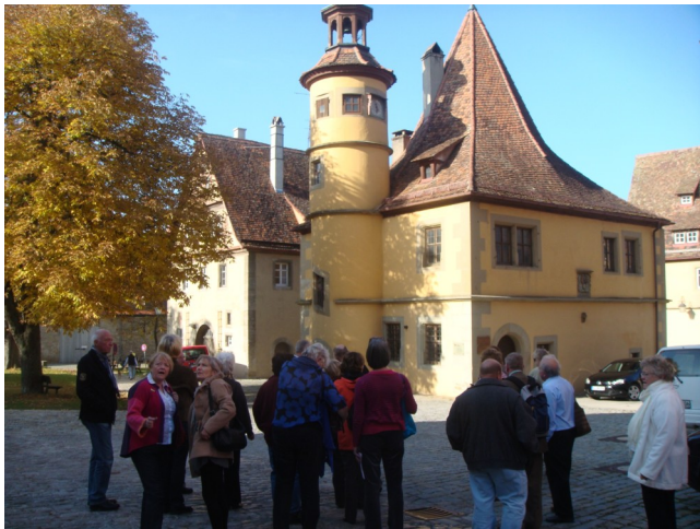
Members of Llandrindod Choir visiting Rothenburg ob der Tauber near Bad Rappenau October 2011

30 Nov-3 Dec : Group from Llandrindod invited to Bad Rappenau Christmas Markets